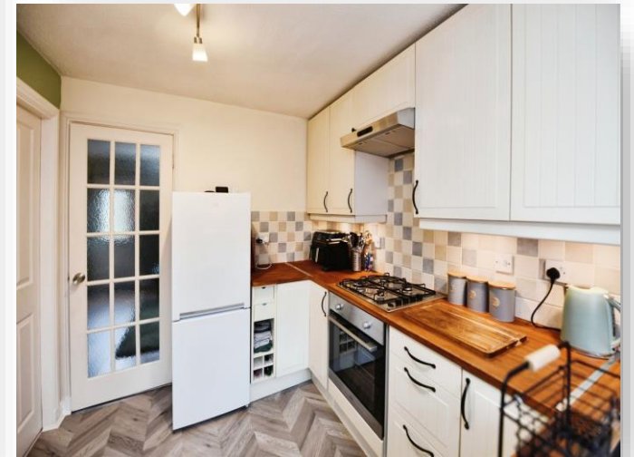
Berryhill Avenue, Girdle Toll Irvine KA11 1QP