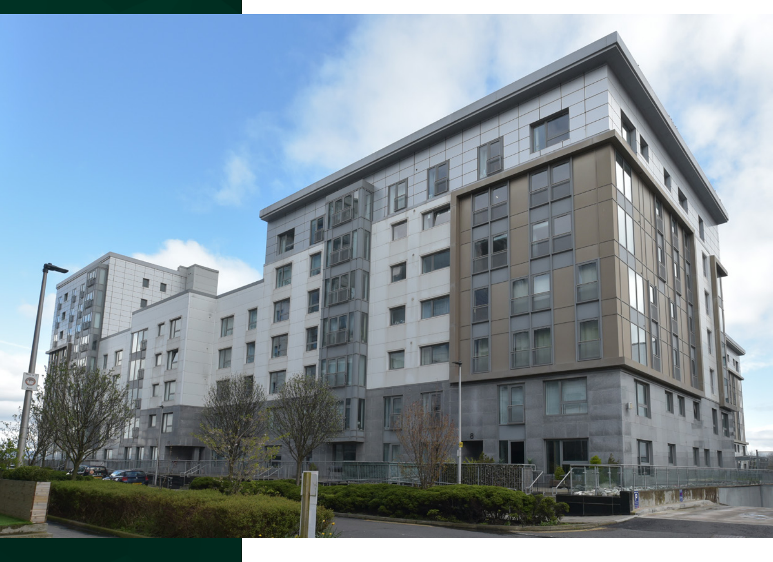
Spacious Two Bedroom Ground Floor Flat With Private Front Garden