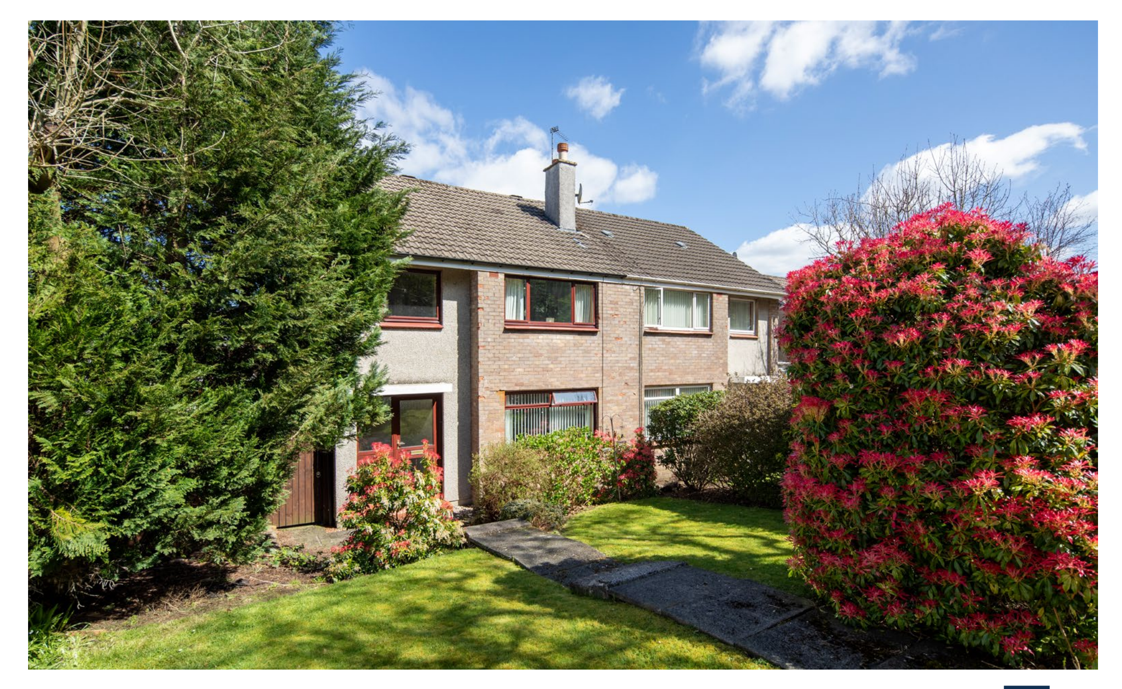
47 Shawwood Crescent, Newton Mearns