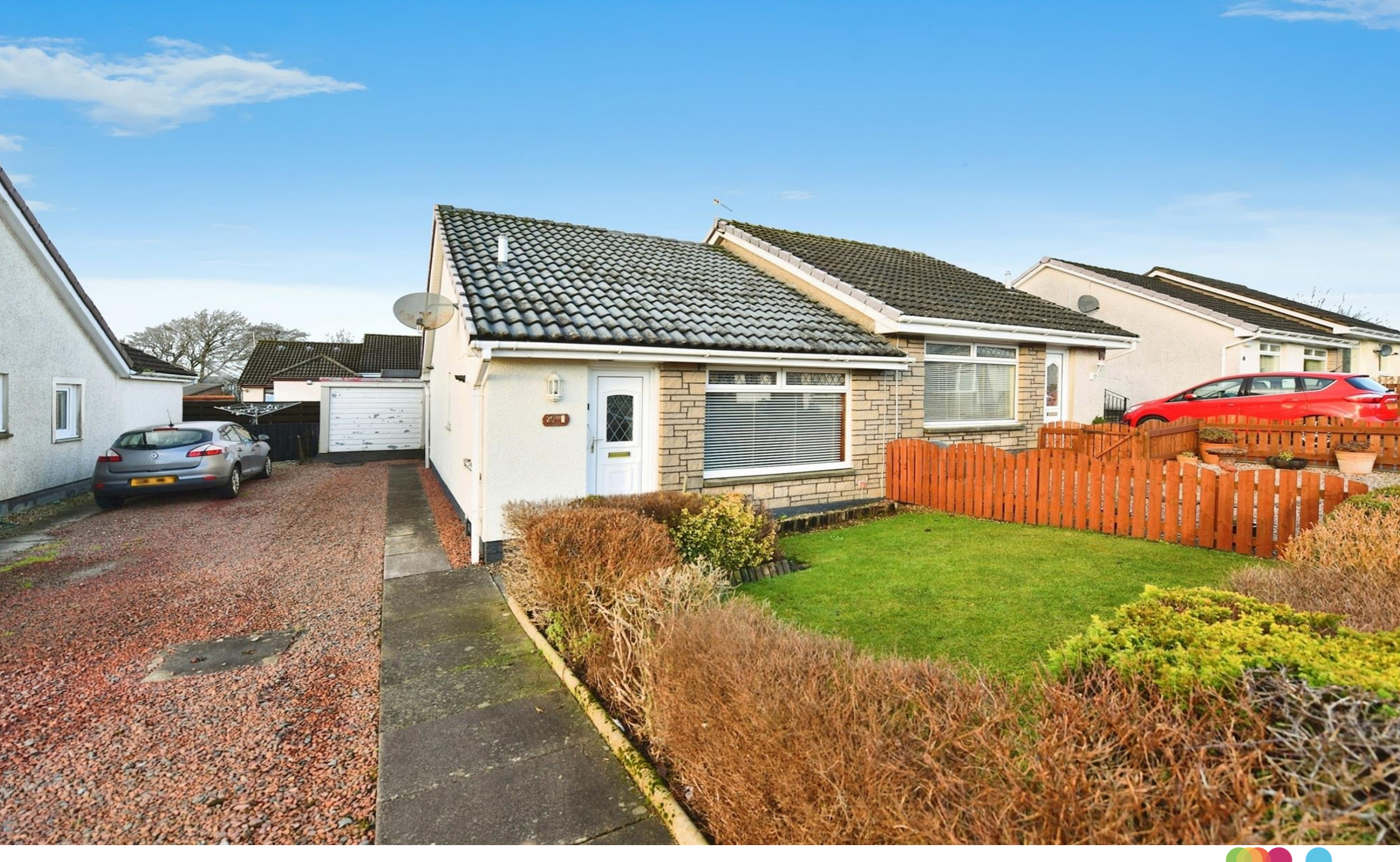
Roseburn Drive, Cumnock KA18 1DH