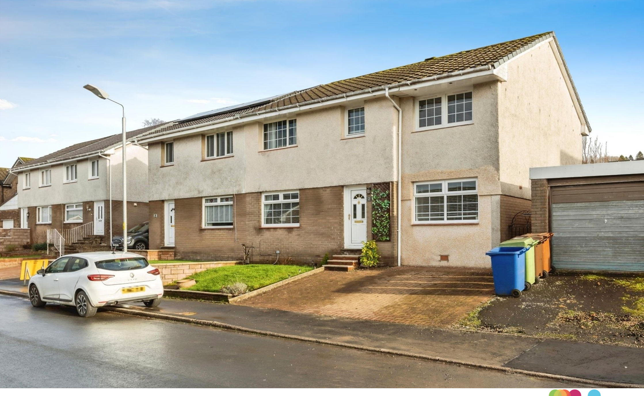
Ashley Rise, Alexandria G83 9NL