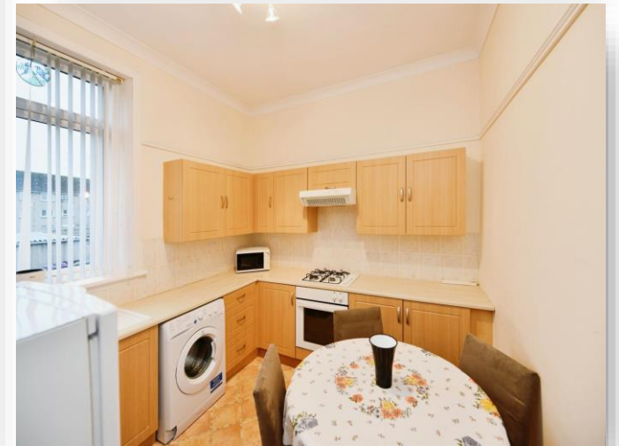
Annick Road, Irvine KA12 0ET