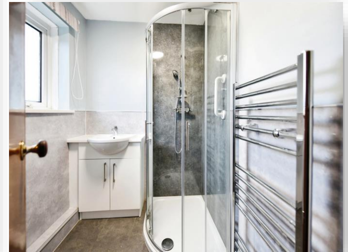
Quarry Road, Irvine KA12 0TN