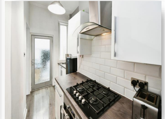
Stevenston Road, KILWINNING KA13 6NH