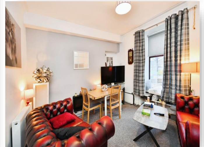
East Road, Irvine KA12 0BS