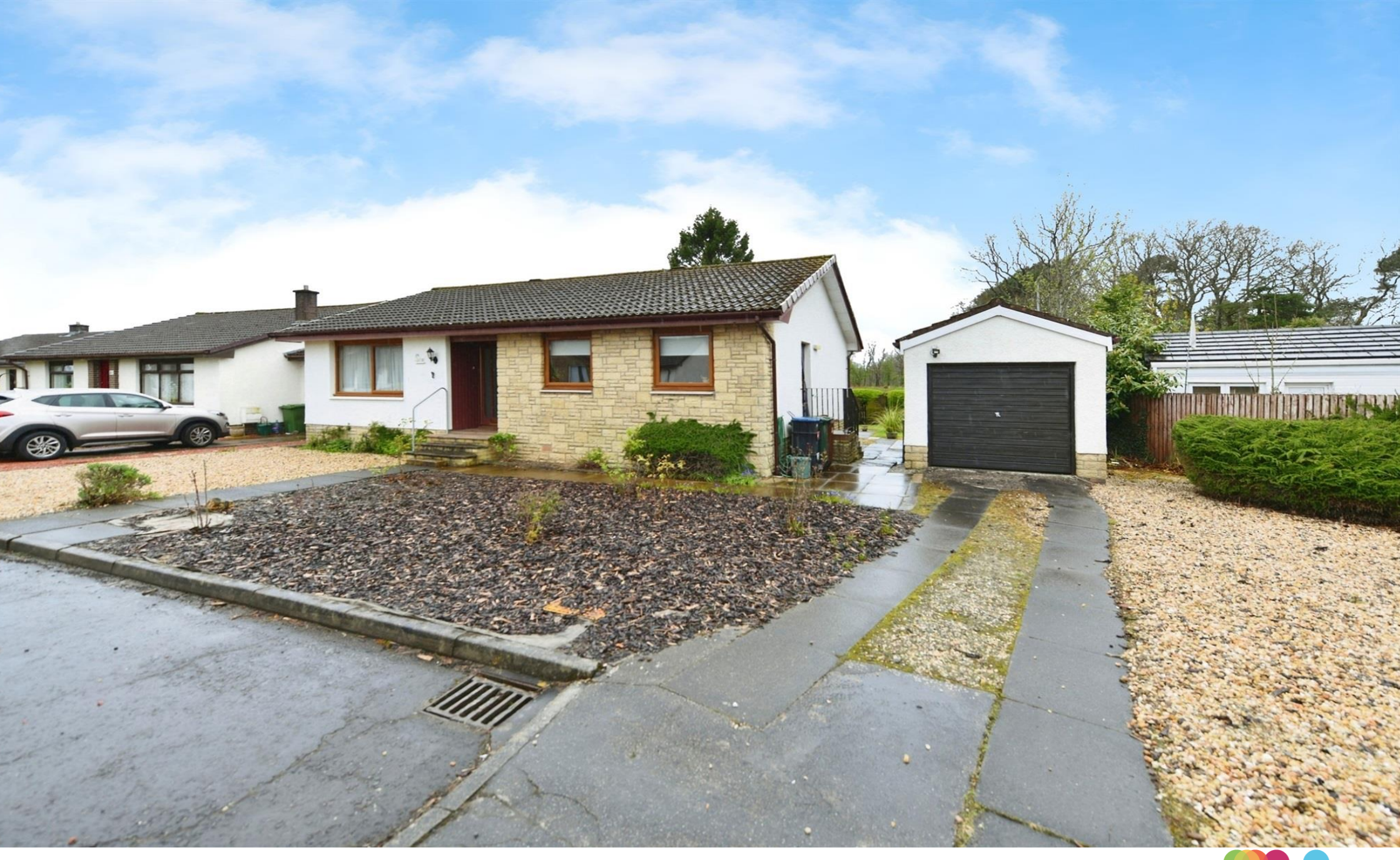
Willie Ross Place, Kilmarnock KA3 7TN