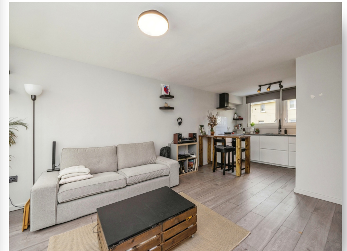
Caroline Crescent, Alva, FK12 5BT