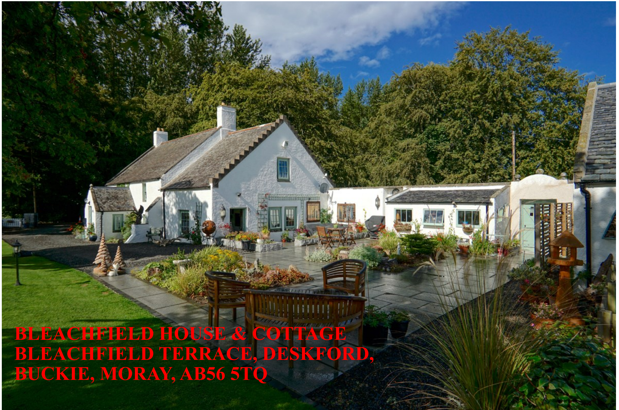
BLEACHFIELD HOUSE & COTTAGE BLEACHFIELD TERRACE, DESKFORD, BUCKIE, MORAY, AB56 5TQ