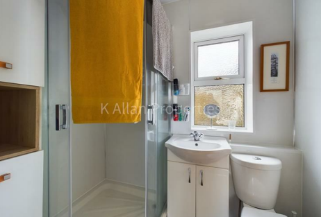
Pierowall Cottage, Westray, Orkney, KW17 2BZ