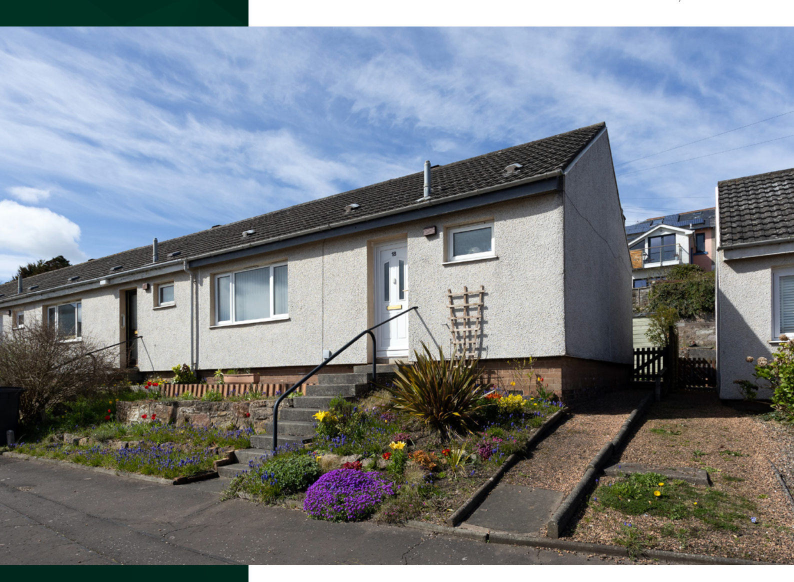
Lovely bungalow located in a quiet cul-de-sac