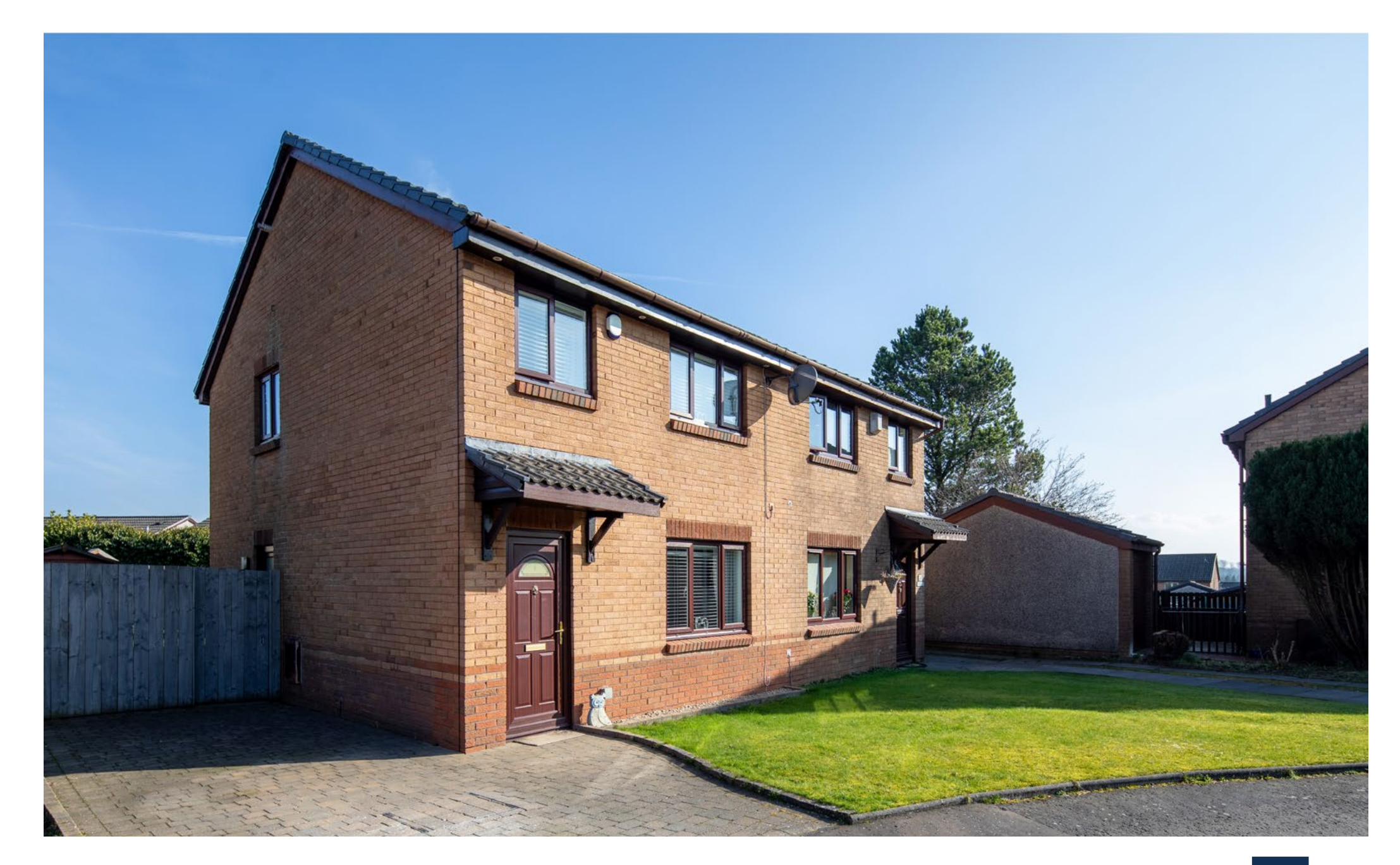
56 Tiree Place, Newton Mearns