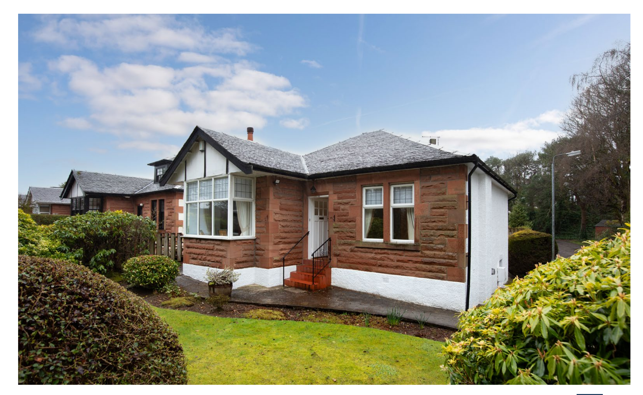
2 Rysland Crescent, Newton Mearns