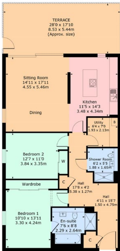
SKETCH PLAN FOR ILLUSTRATIVE PURPOSES ONLY

Approximate gross internal area Apartment = 1240 sq ft - 115 sq m Terrace = 499 sq ft - 46 sq m Total = 1739 sq ft - 161 sq m