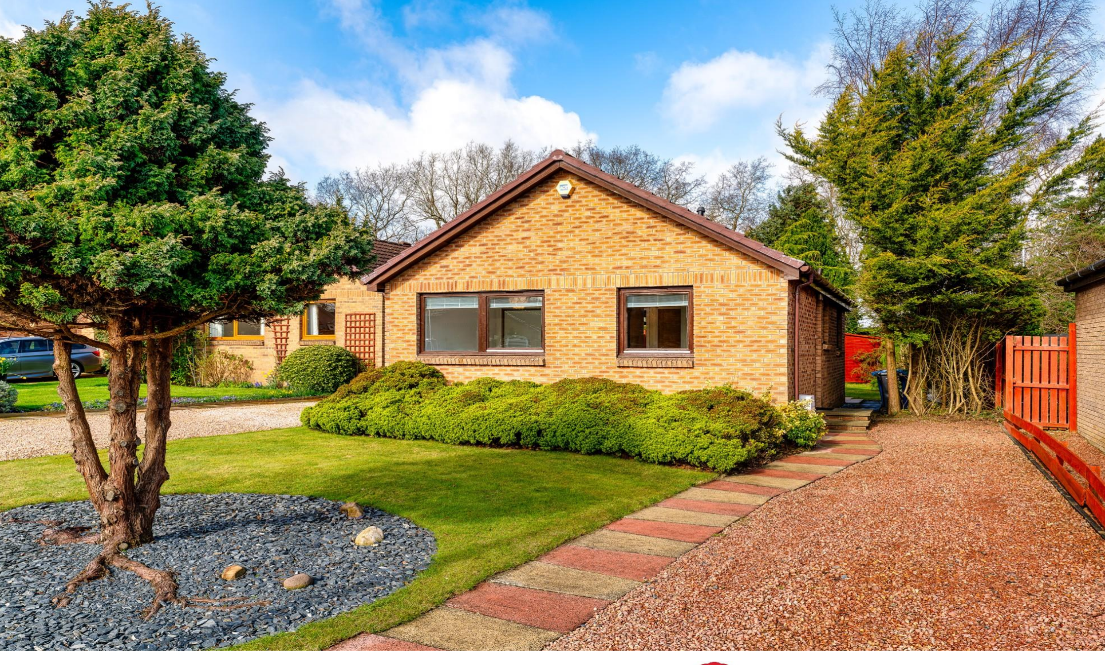
East Bankton Place, Livingston, West Lothian, EH54 9DB