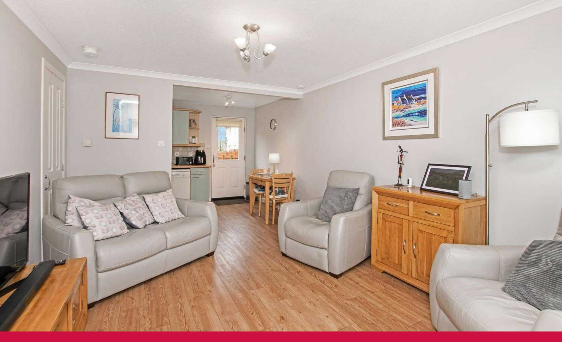
Bright and well presented end terraced villa enjoying a pleasant location within popular residential area convenient for motorway and train station. Entrance hall, Lounge, Kitchen, 2 Double bedrooms, Shower room. Double glazing. Gas central heating. Neat gardens. Off street parking to the front. Modern decor. Excellent starter home in move in condition. EPC - D. Council tax - C. Freehold.