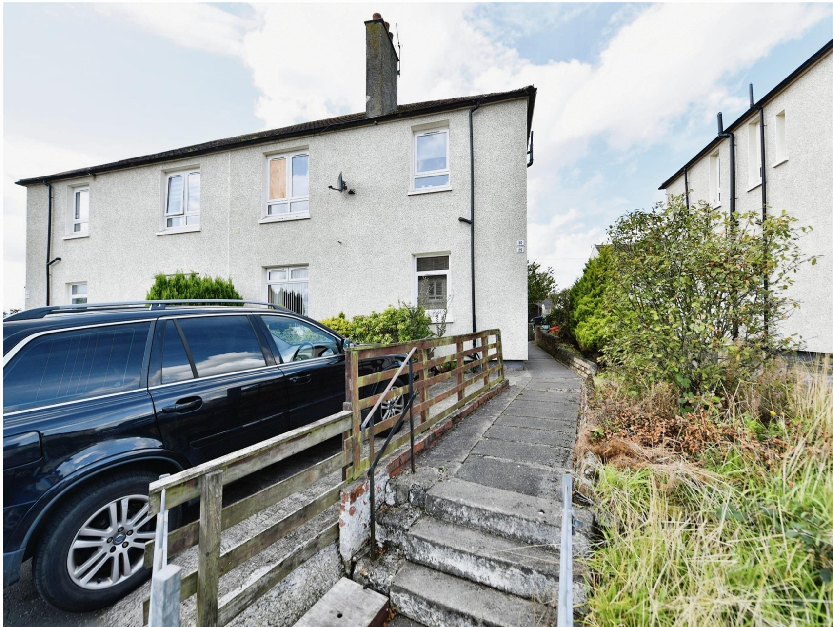
Milton View, Gatehead Kilmarnock KA2 0AY