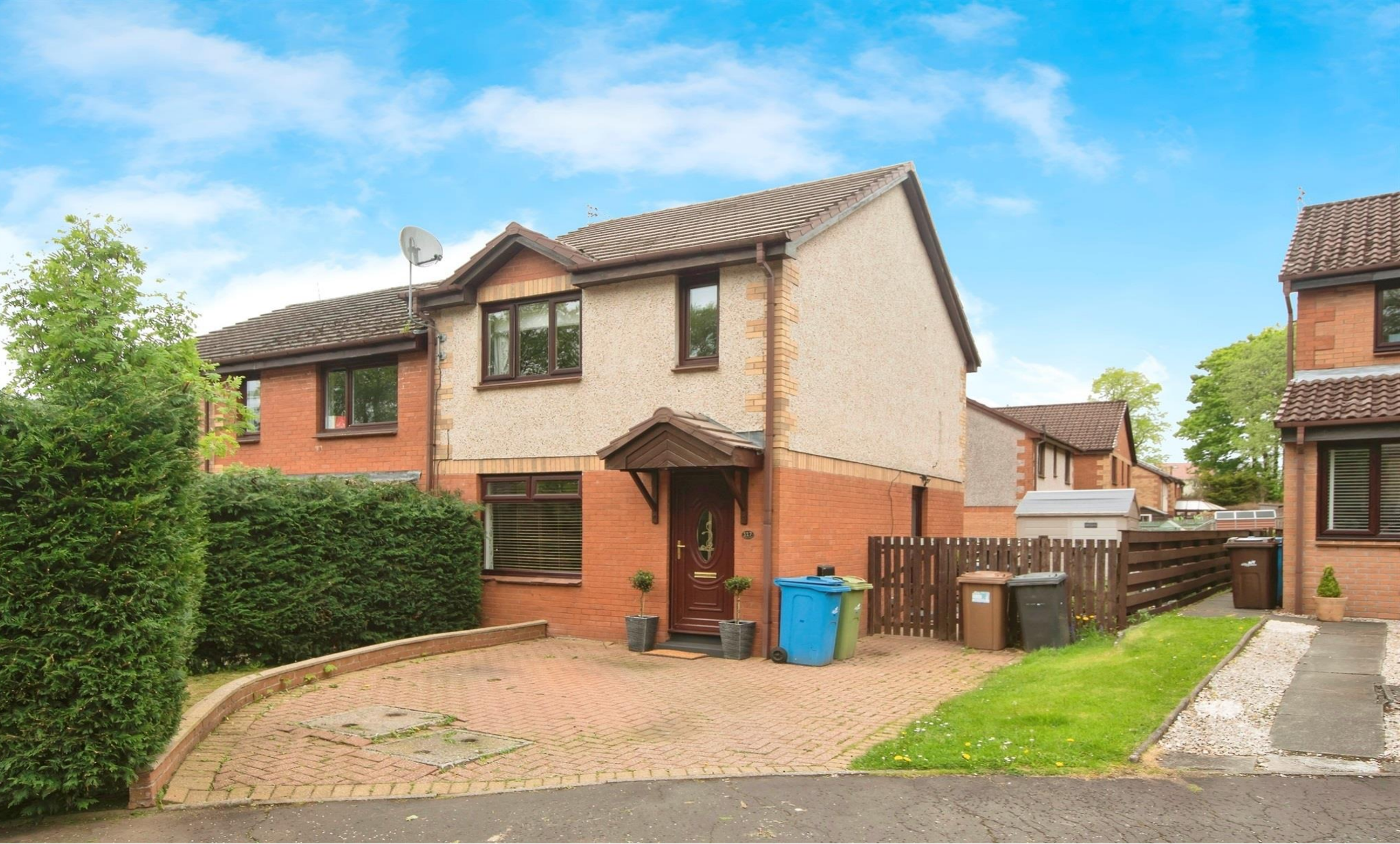
Aurs Glen, Barrhead, Glasgow G78 2LJ