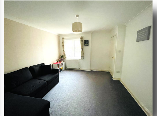
Fincastle Place, Cowie, Stirling, FK7 7DS