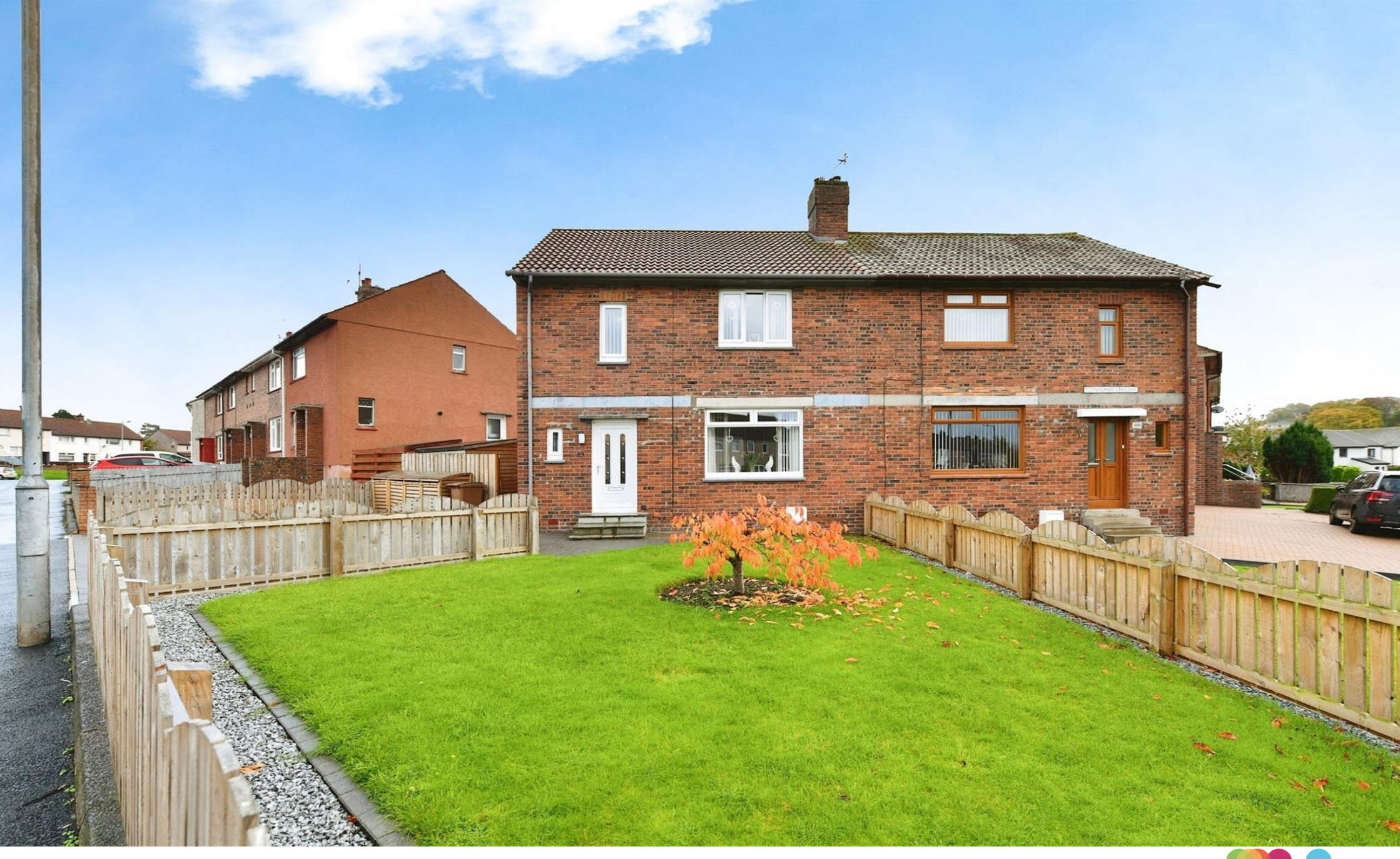
Glencairn Road, Ayr KA7 3HL