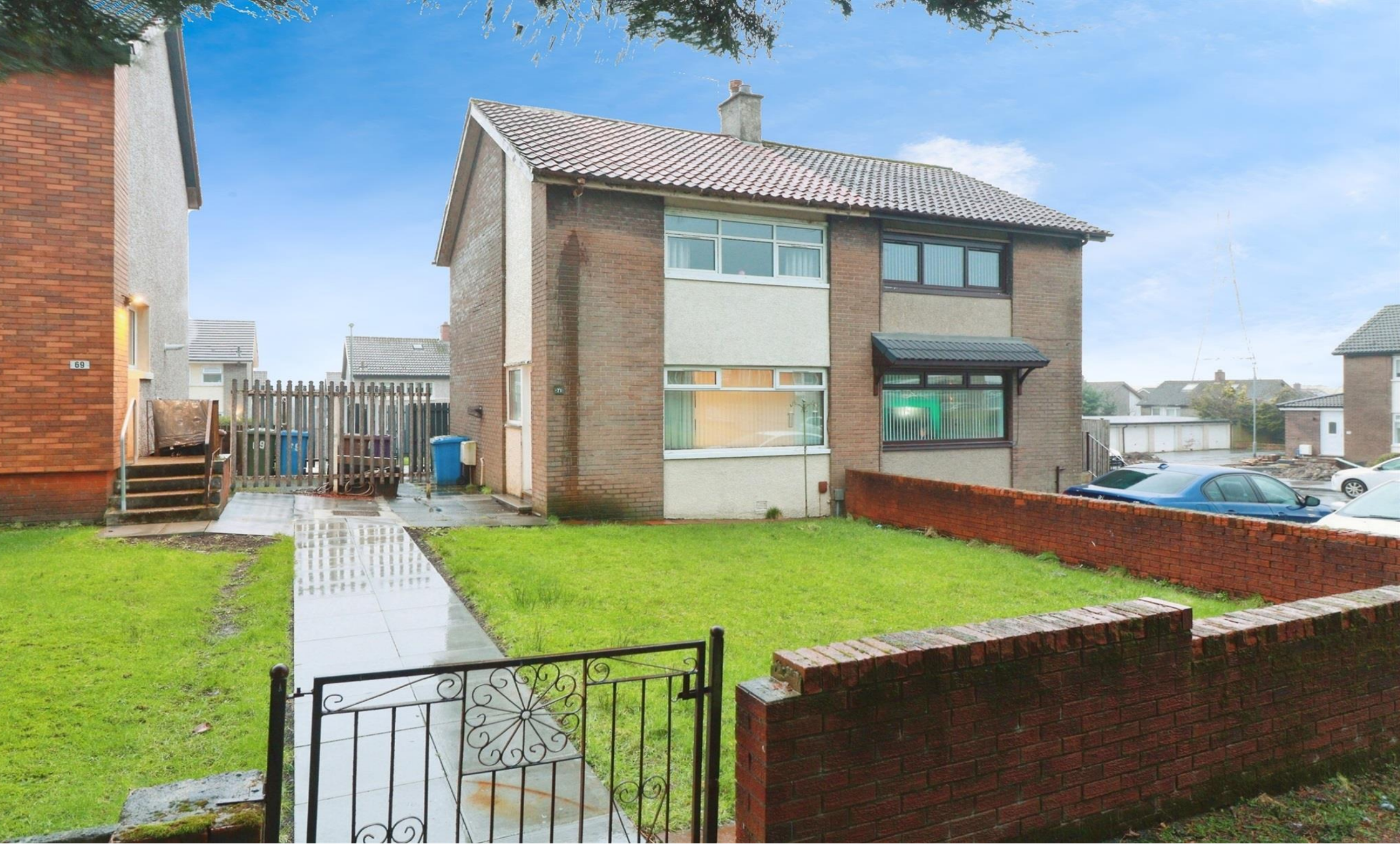
Hillswick Crescent, GLASGOW G22 7PR

Not for marketing purposes. INTERNAL USE ONLY