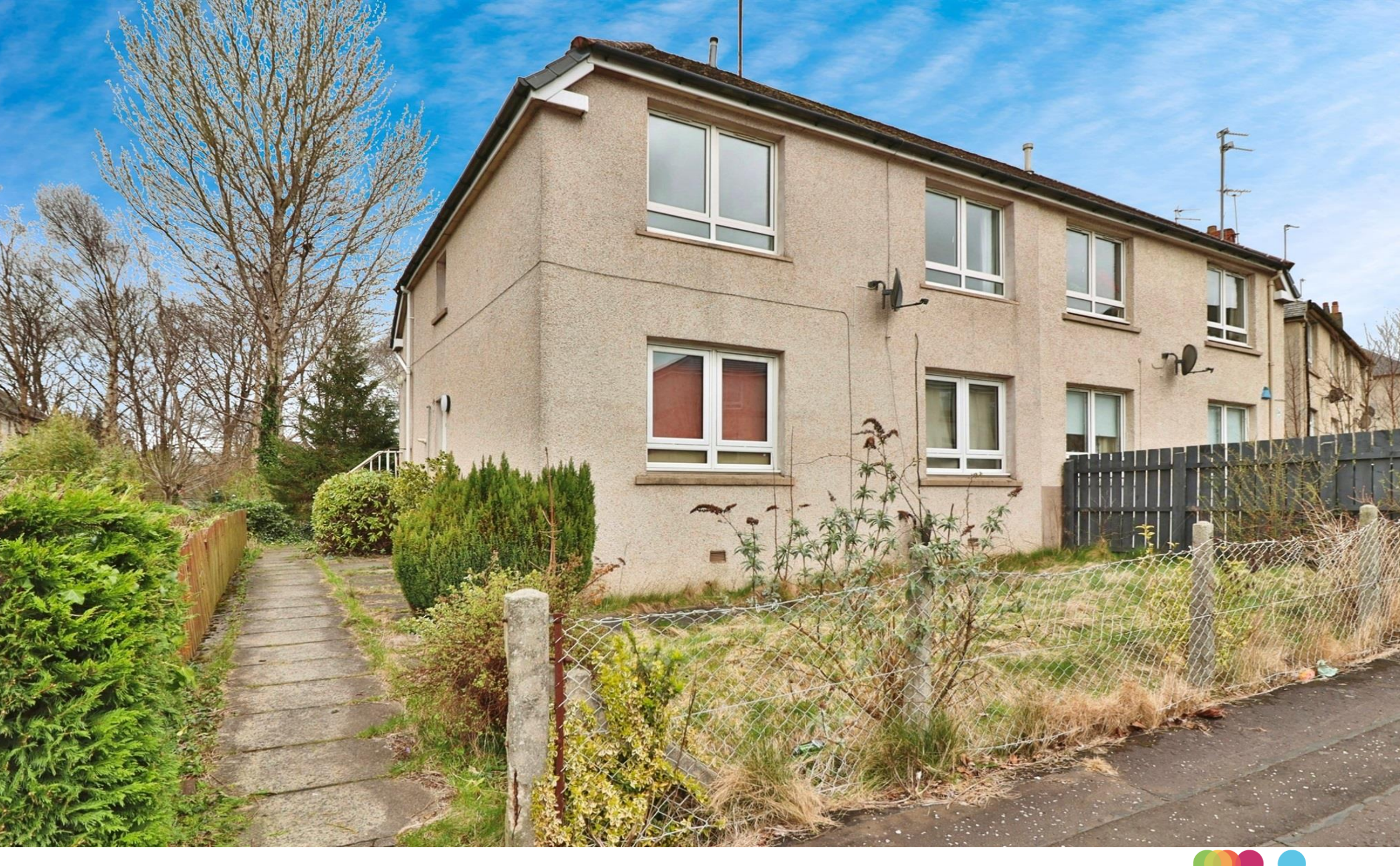
Emerson Road, Bishopbriggs Glasgow G64 1QH