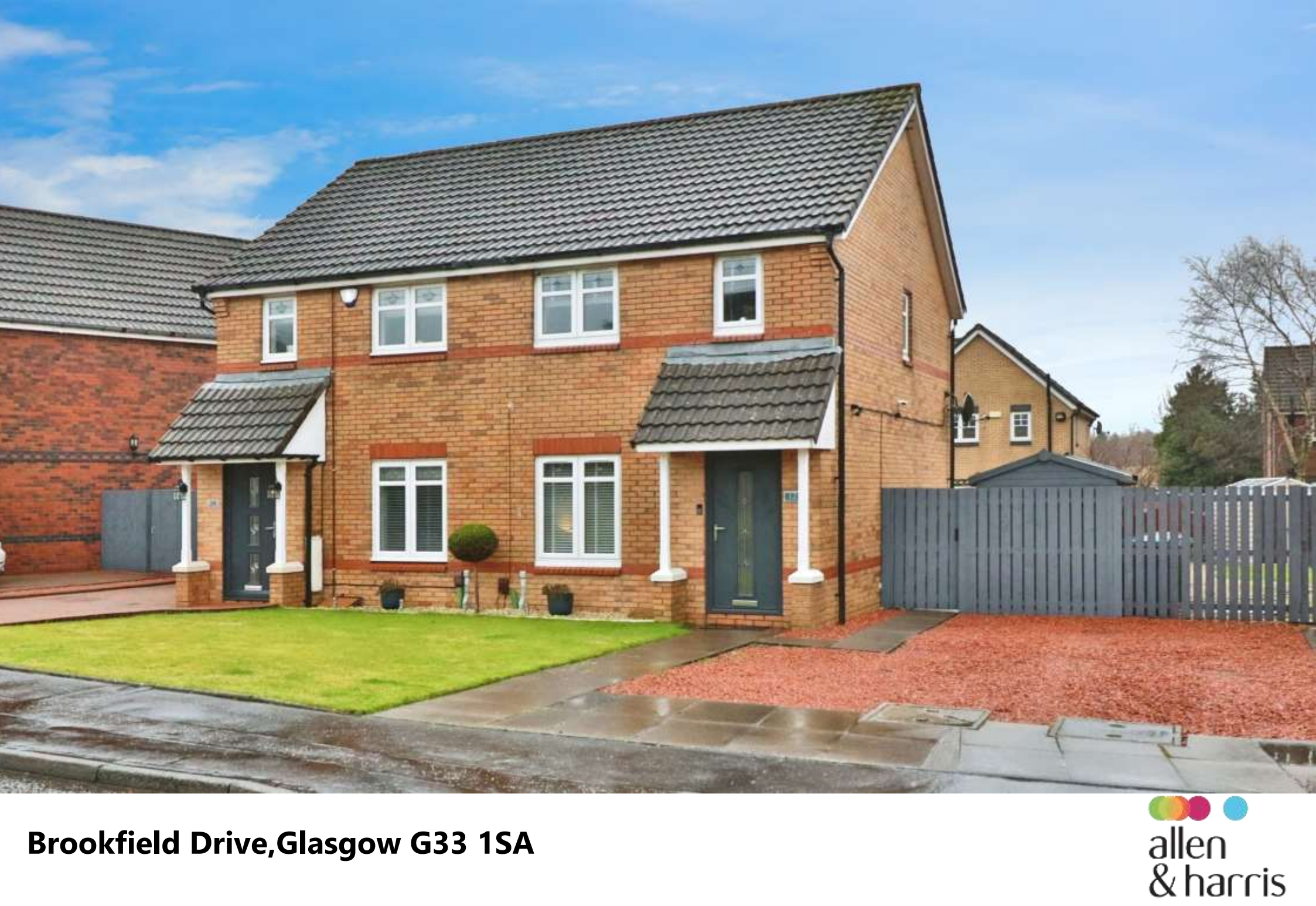
Brookfield Drive, Glasgow G33 1SA