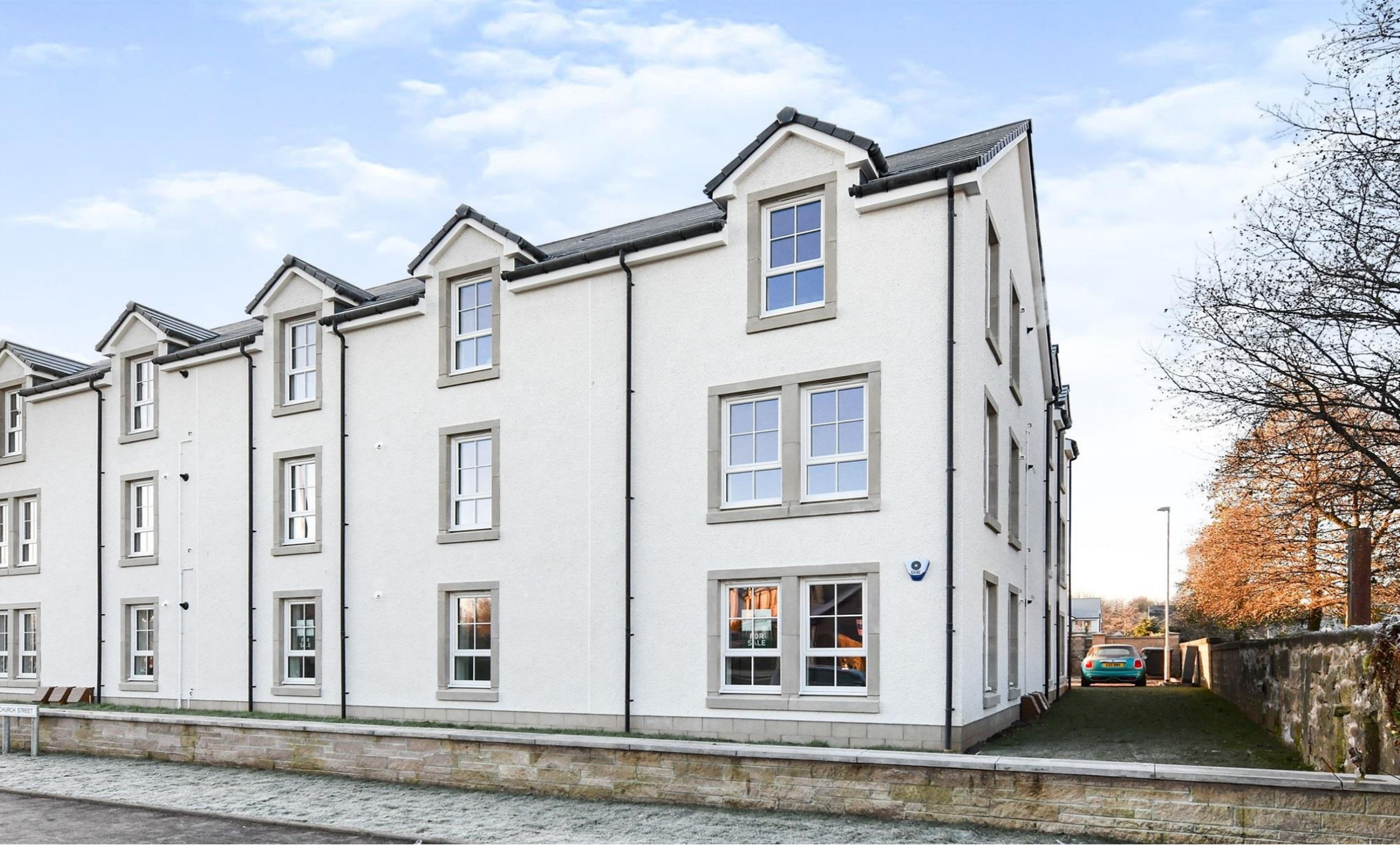
Lochwynd, Lochwinnoch PA12 4FA