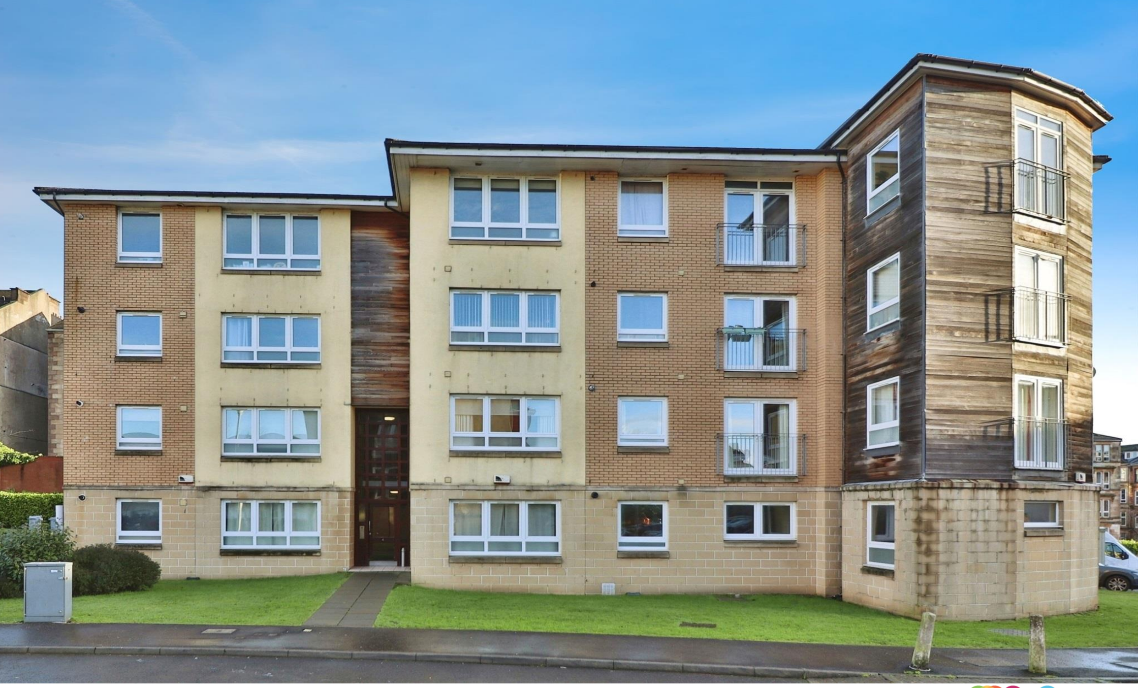
Whitehill Court, GLASGOW G31 2BA