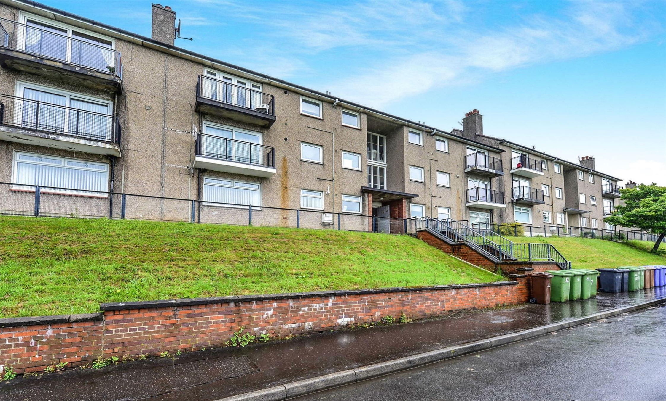
Valeview Terrace, Dumbarton G82 3BL