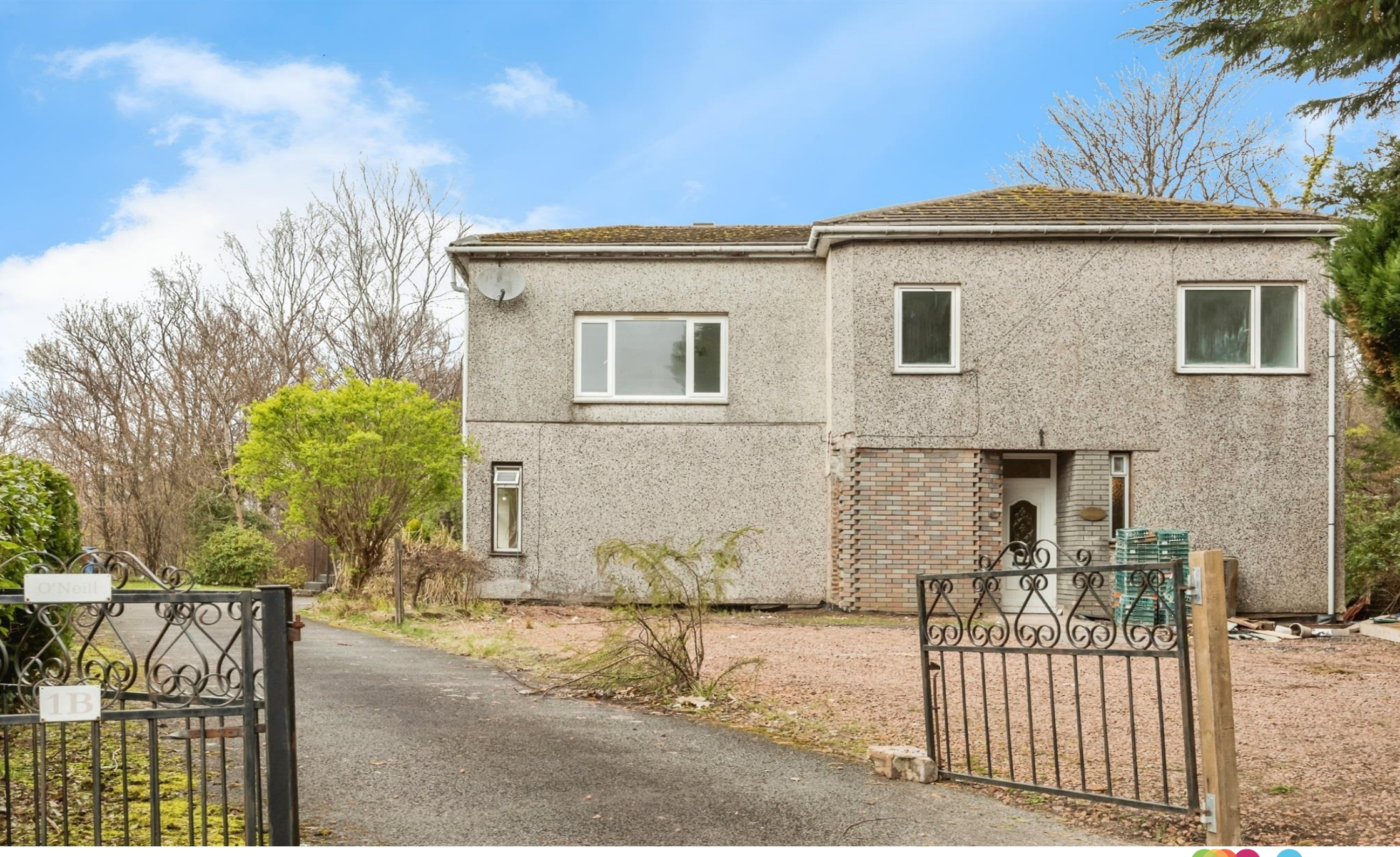
Barnhill Road, Dumbarton G82 2SD