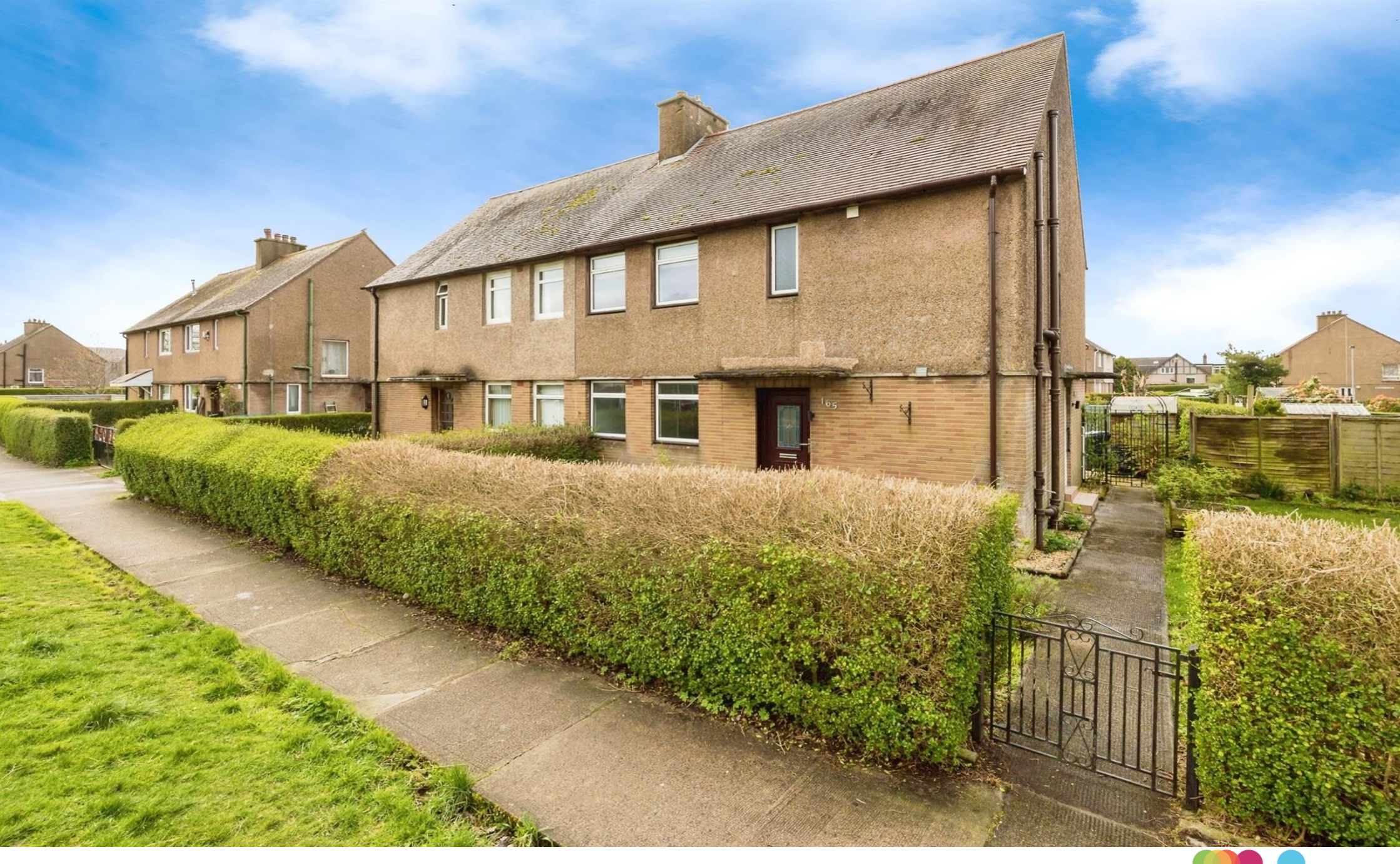
West King Street, Helensburgh G84 8DL