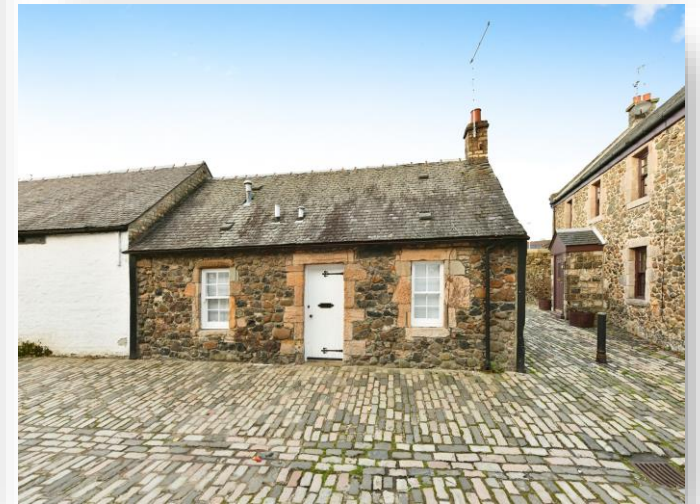
Pine Cottage Glasgow Vennel, Irvine KA12 0BD