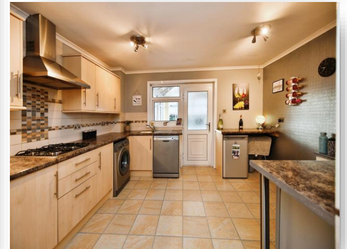
Hillshaw Green, Bourtreehill South Irvine KA11 1EQ