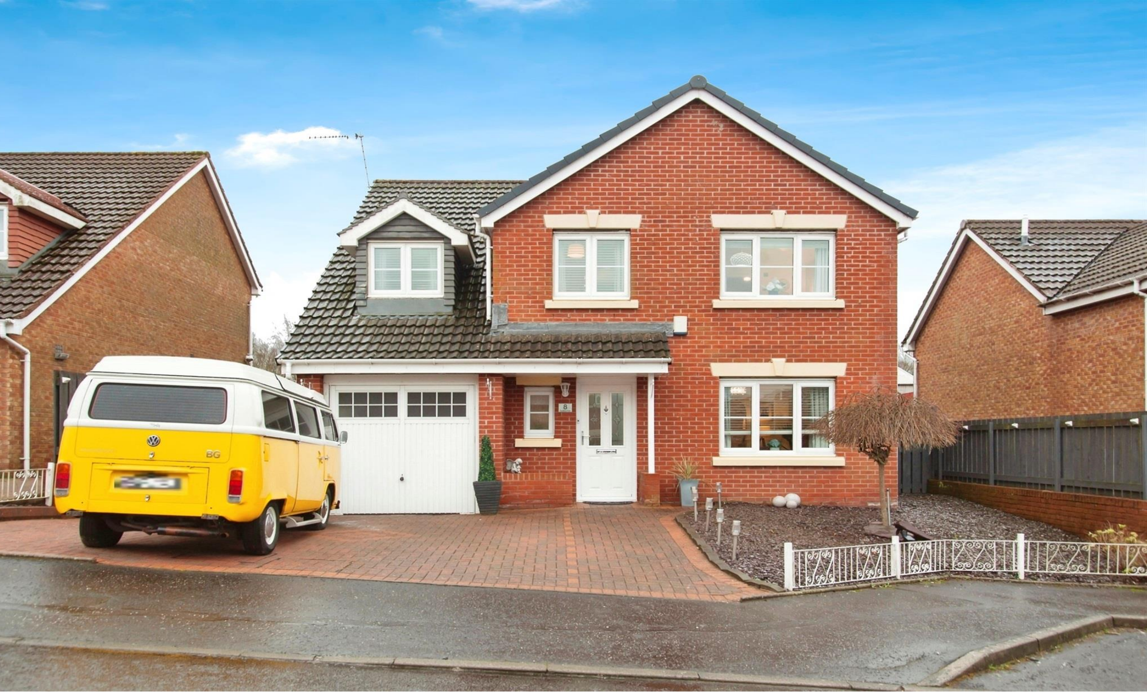
Hillman Crescent, Paisley, PA3 3FD