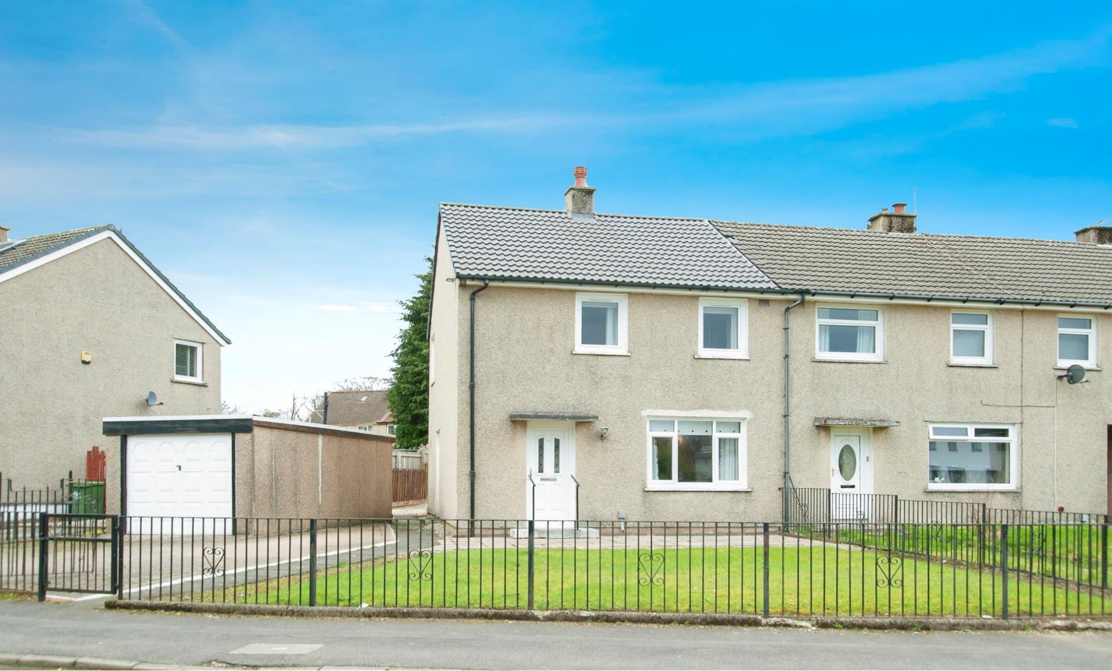
Ramsay Place, Johnstone, PA5 0EX