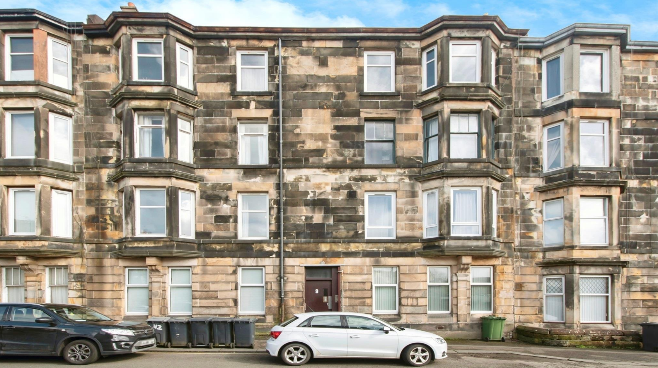
Walker Street, Paisley PA1 2EN

Not for marketing purposes INTERNAL USE ONLY