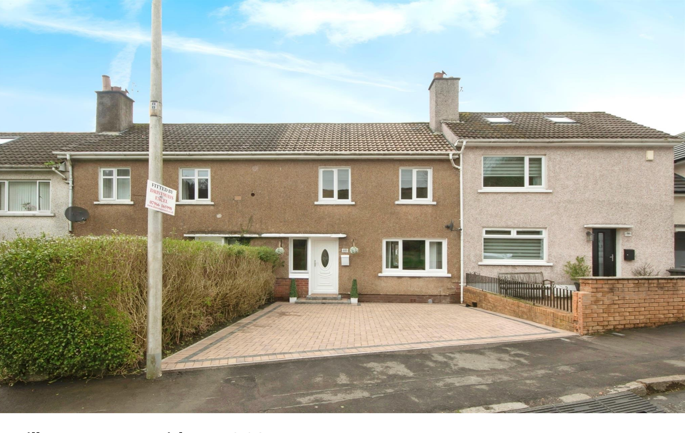
Hillcrest Avenue, Paisley, PA2 8QR