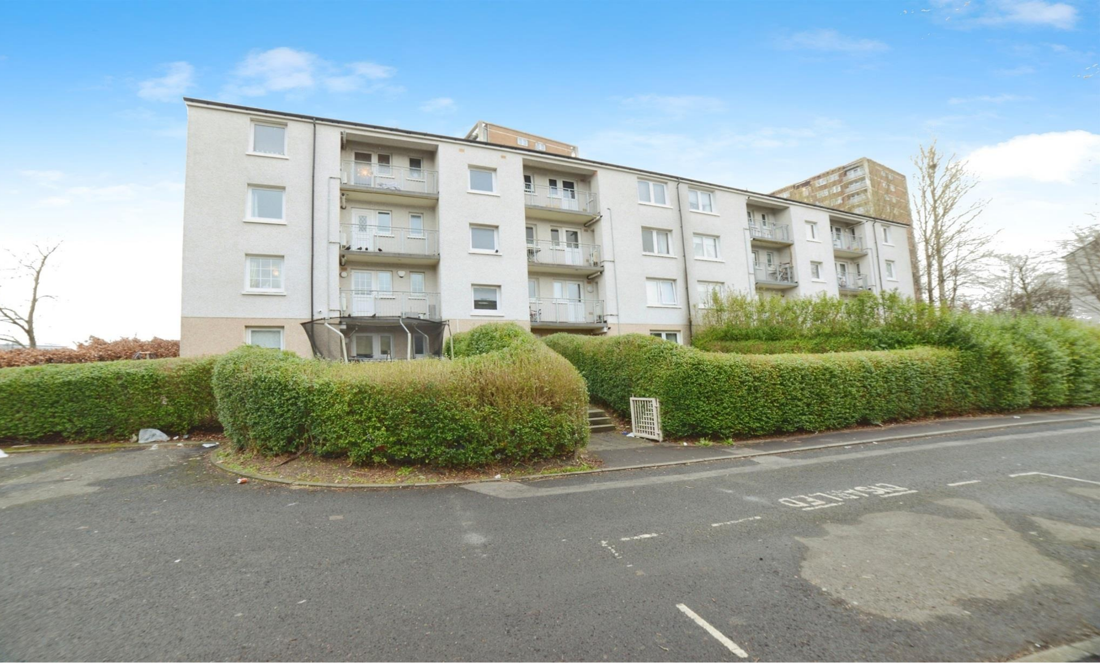
Morefield Road, Glasgow G51 4NG