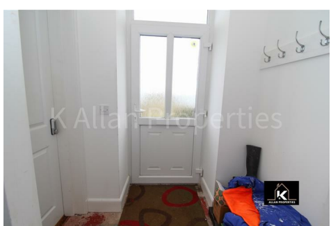
Flat 1 & 2, Custom House, Longhope, , KW16 3PG