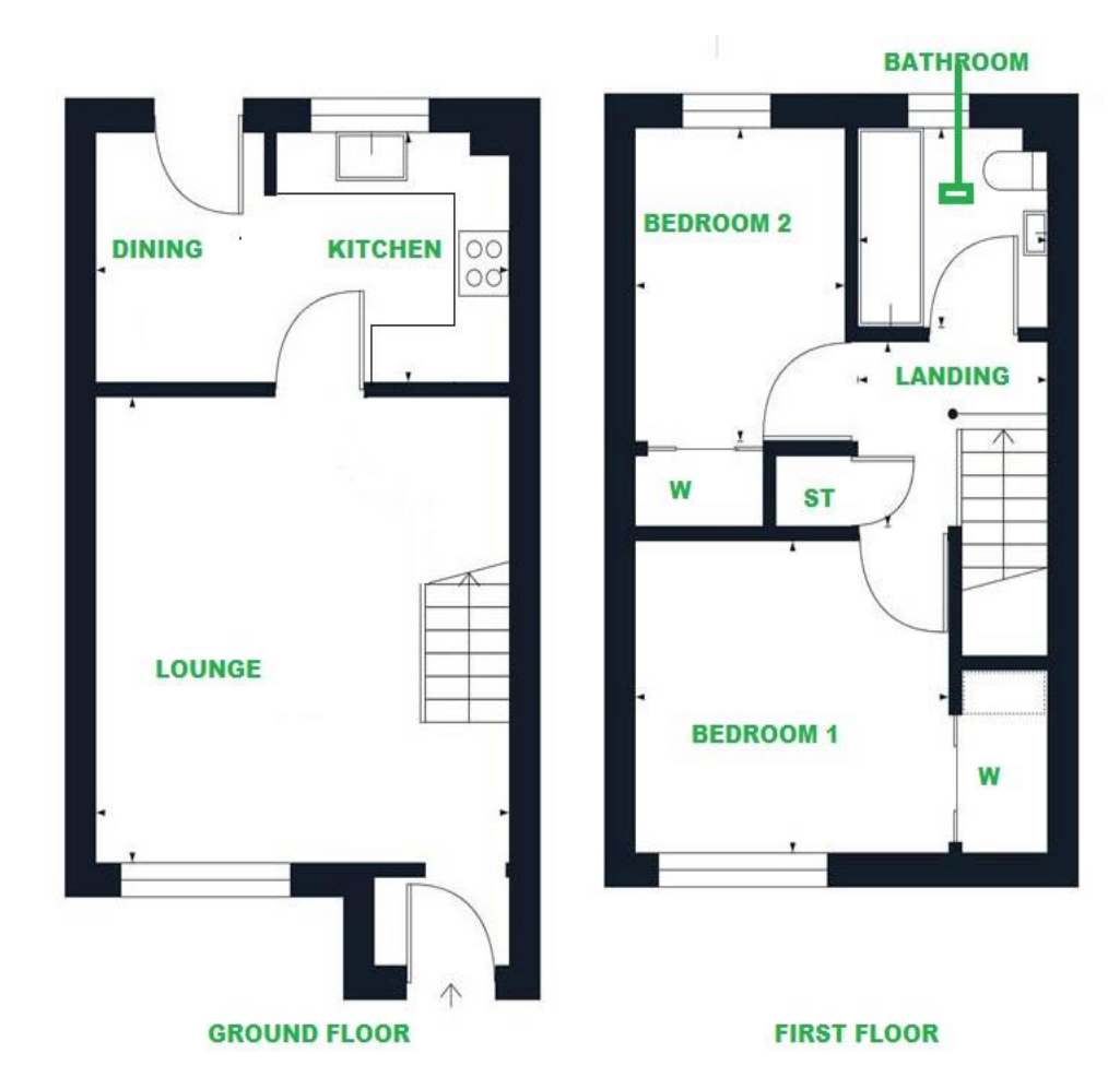
These particulars are intended to give a fair description of the property but their accuracy cannot be guaranteed, and they do not constitute an offer of contract. Intending purchasers must rely on their own inspection of the property. None of the appliances/services have been tested by ourselves. We recommend that purchasers arrange for a qualified person to check all appliances/services before legal commitment.