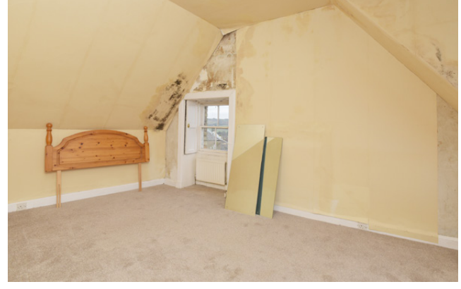
bedrooms & bathrooms