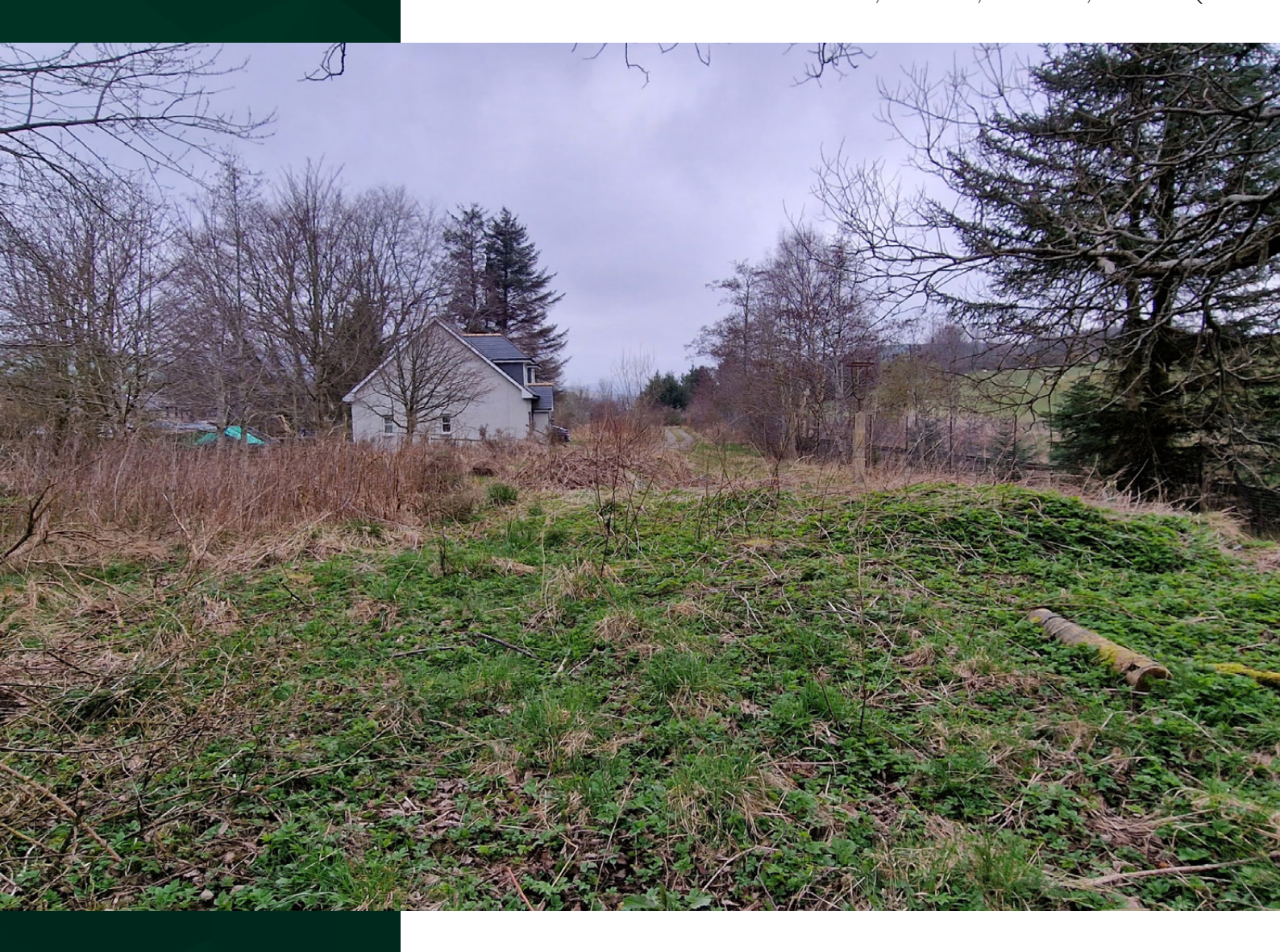
GENEROUS-SIZED BUILDING PLOT OF APPROXIMATELY 0.22 ACRES

OLD MILITARY ROAD, GARTLY, HUNTLY, AB54 4QA