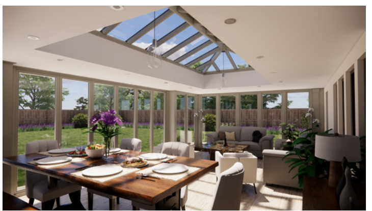
*Optional orangery, indicative only