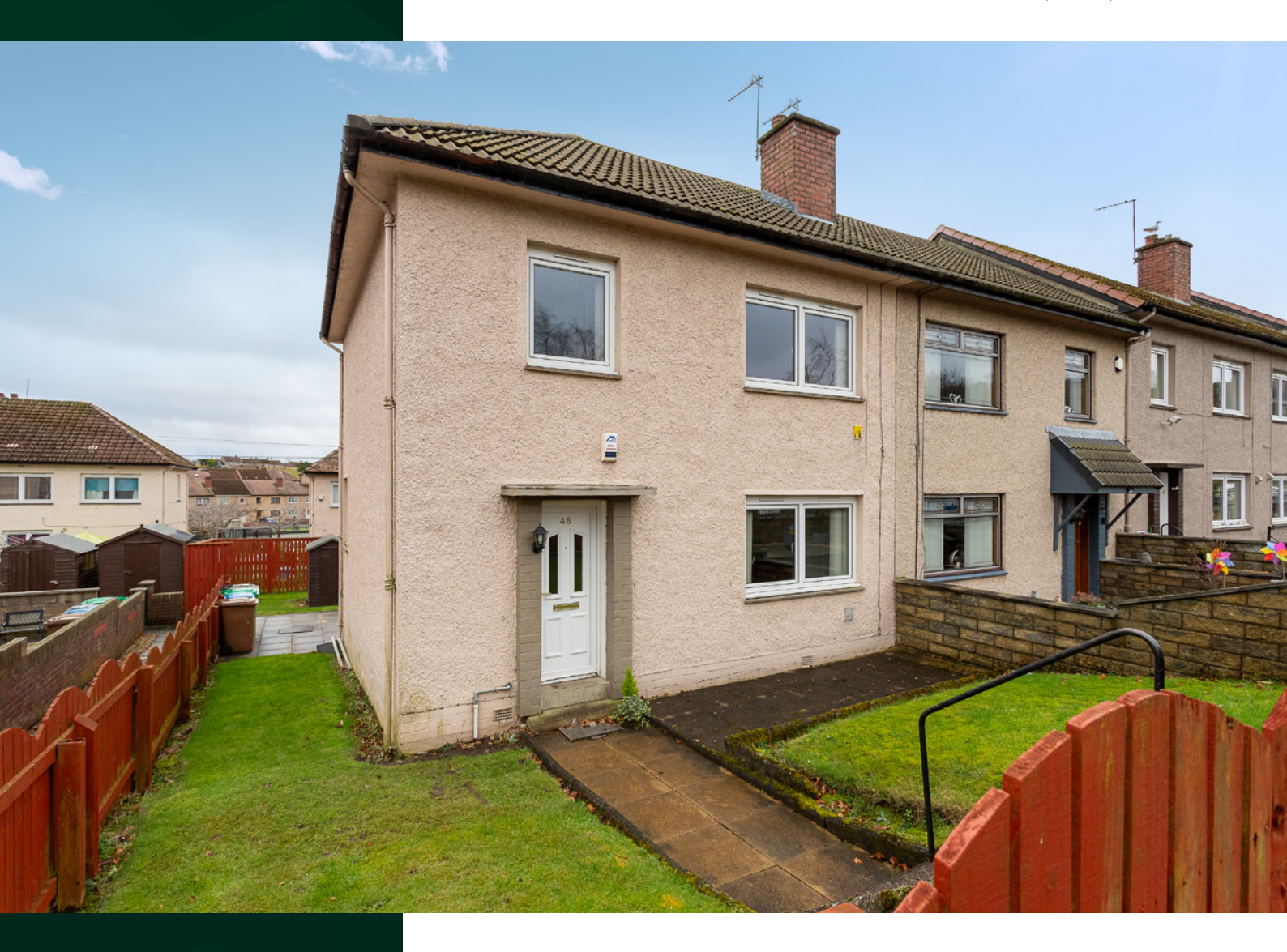
Spacious three-bedroom home in a popular residential location