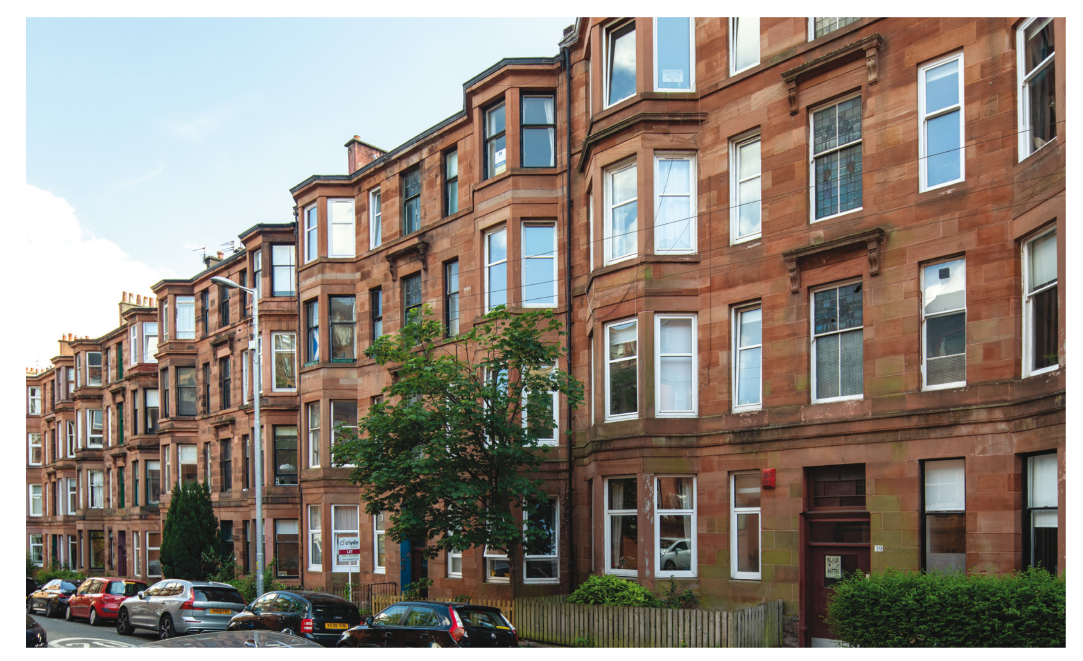
Flat 3/2, 37 Caird Drive, Partickhill