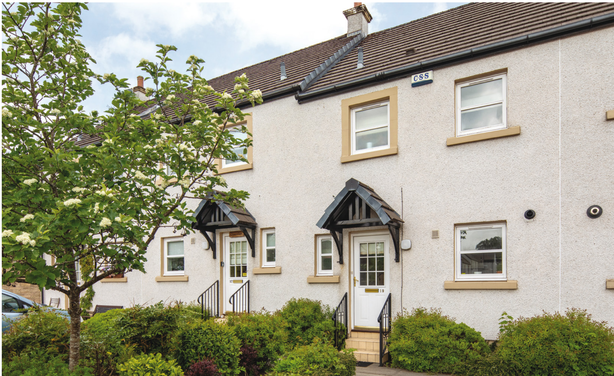
19 The Dell, Newton Mearns