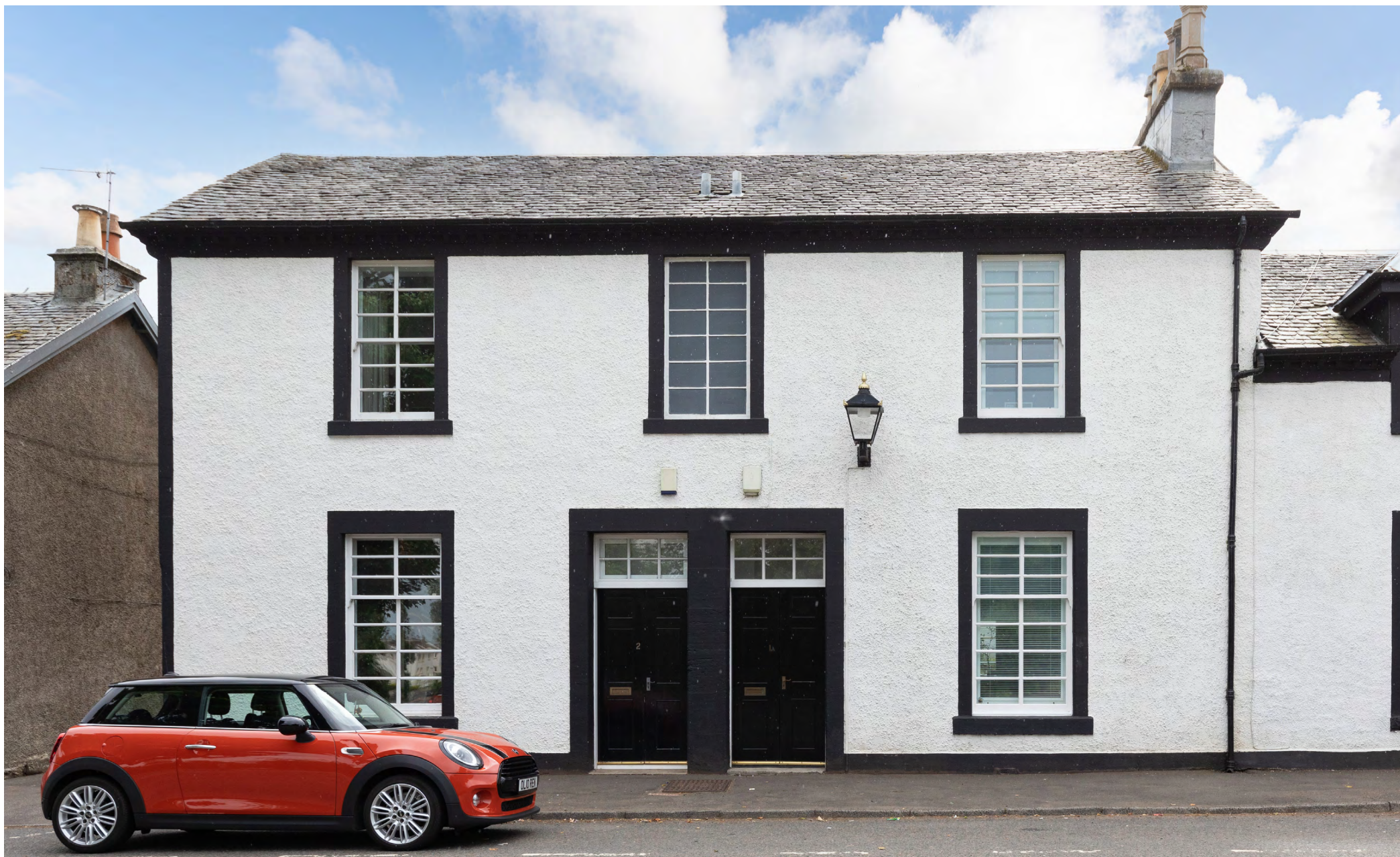
Eglinton Mews, 1A Cheapside Street, Eaglesham