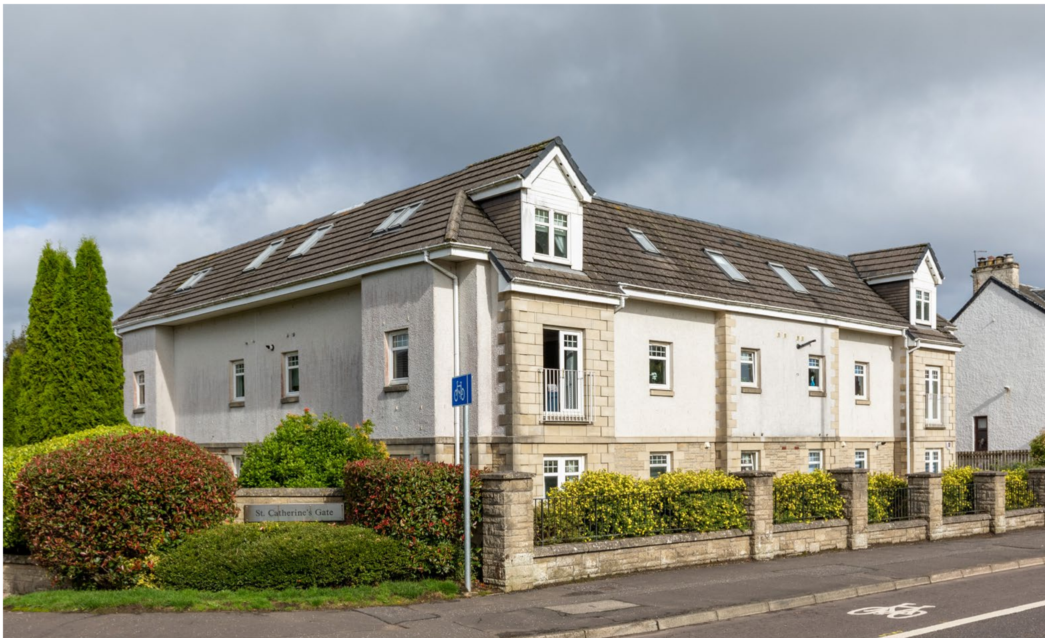
Apt 1 St. Catherine's Gate, 292 Ayr Road, Newton Mearns