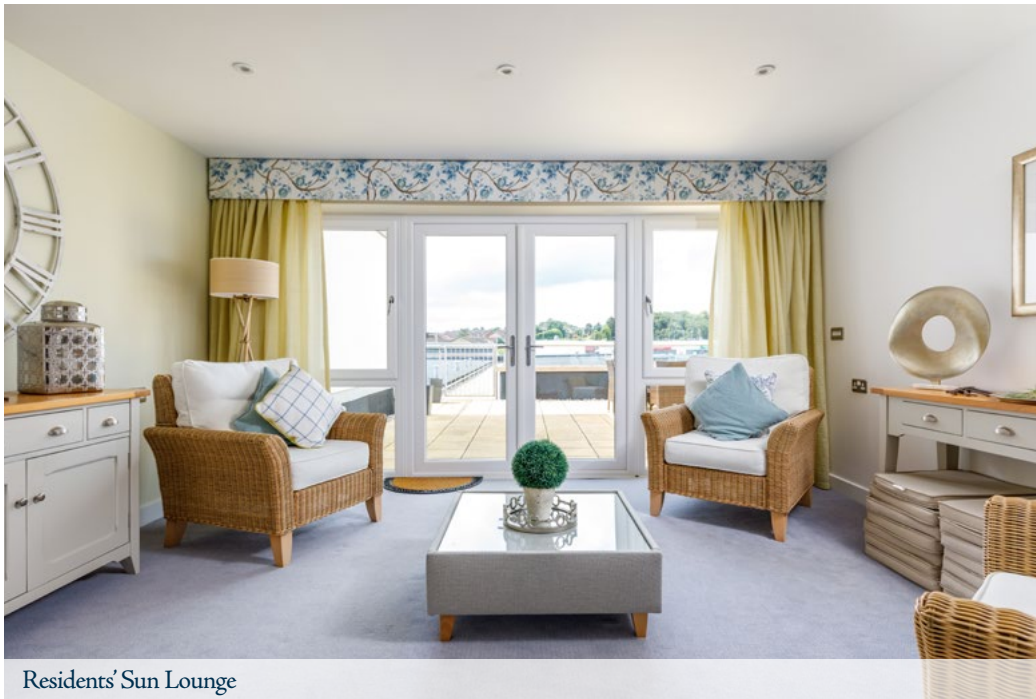
Residents' Sun Lounge