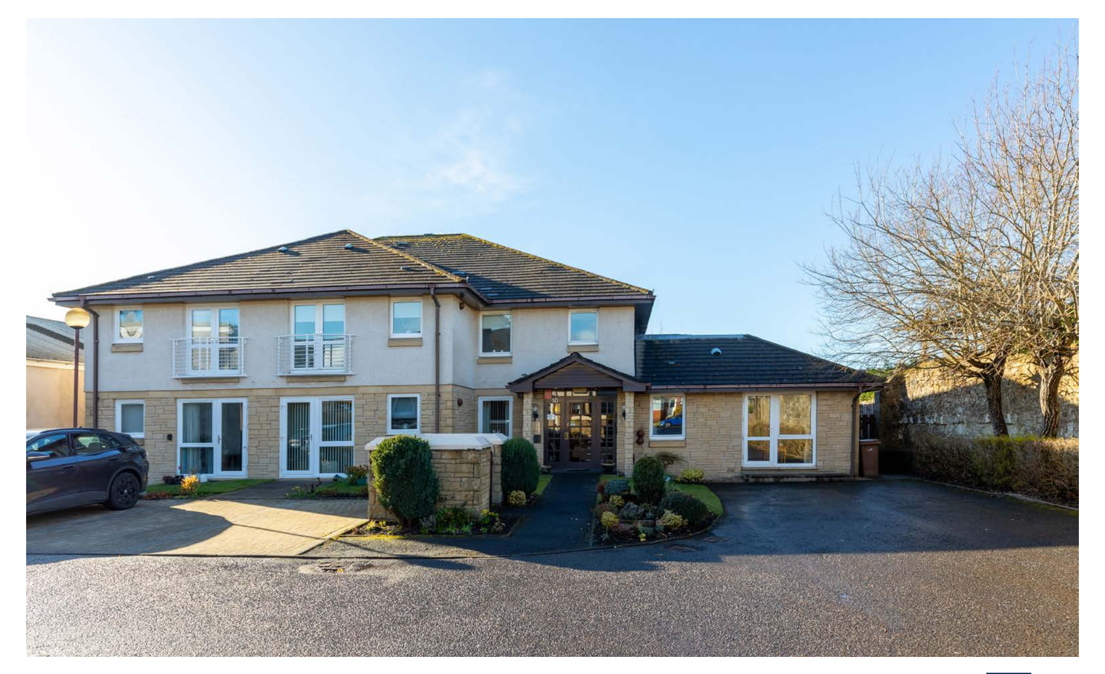
Flat 8 Carleton Court, 10 Fenwick Road, Giffnock